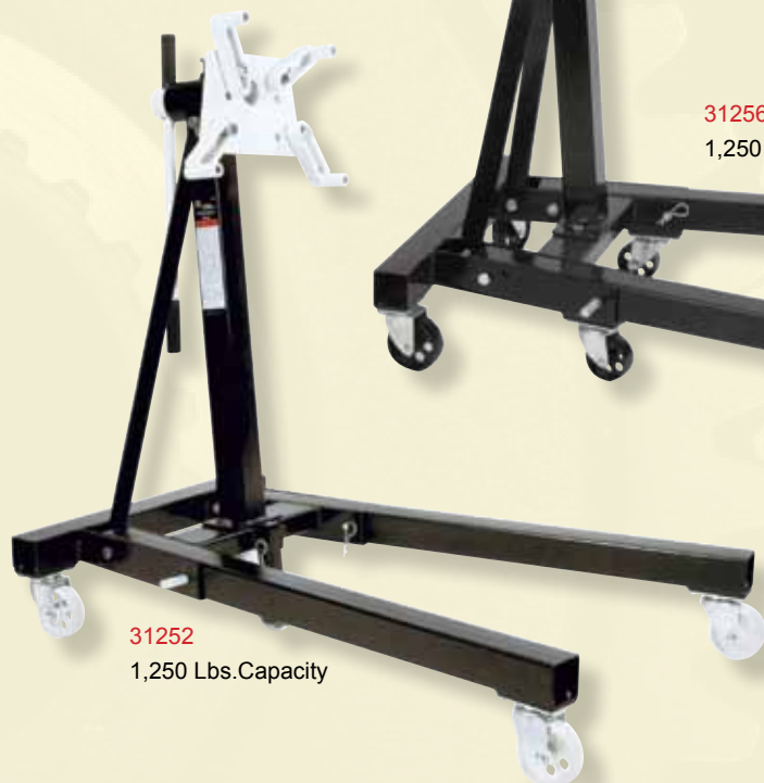
31252 1,250 Lbs.Capacity