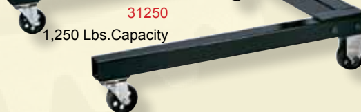
31250 1,250 Lbs.Capacity

SMOOTH ROTATION Heavy duty worm gear allows for smooth and effortless engine rotation