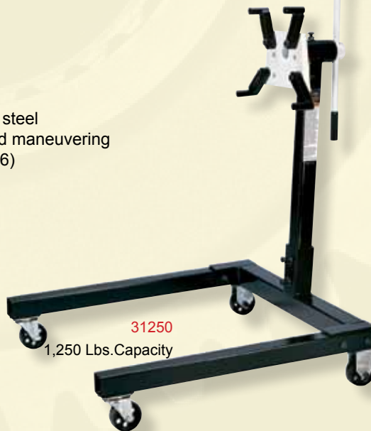
31250 1,250 Lbs.Capacity

SMOOTH ROTATION Heavy duty worm gear allows for smooth and effortless engine rotation