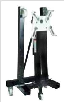
Foldable Legs (Available on 31252 and 31256)

SMOOTH ROTATION Heavy duty worm gear allows for smooth and effortless engine rotation