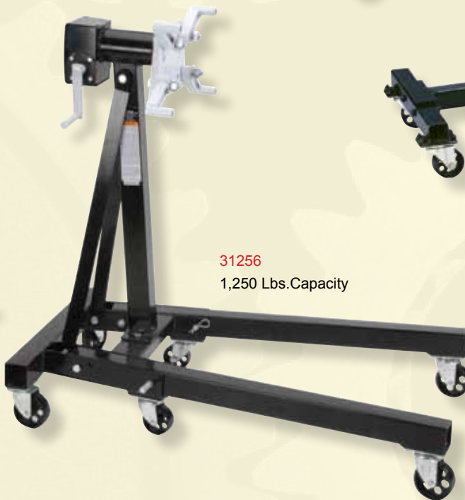
31256 1,250 Lbs.Capacity