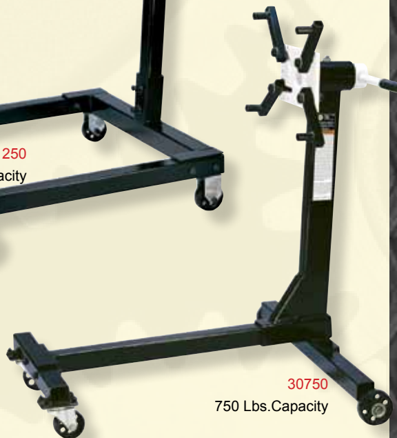
30750 750 Lbs.Capacity