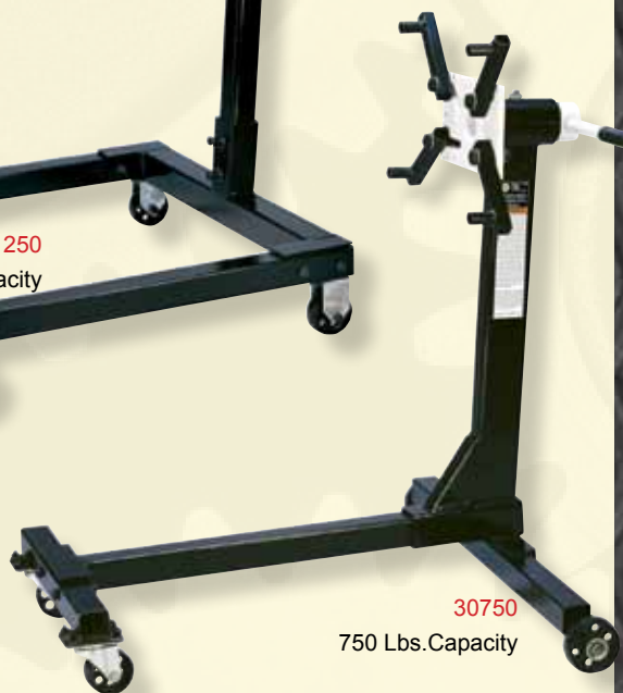
30750 750 Lbs.Capacity